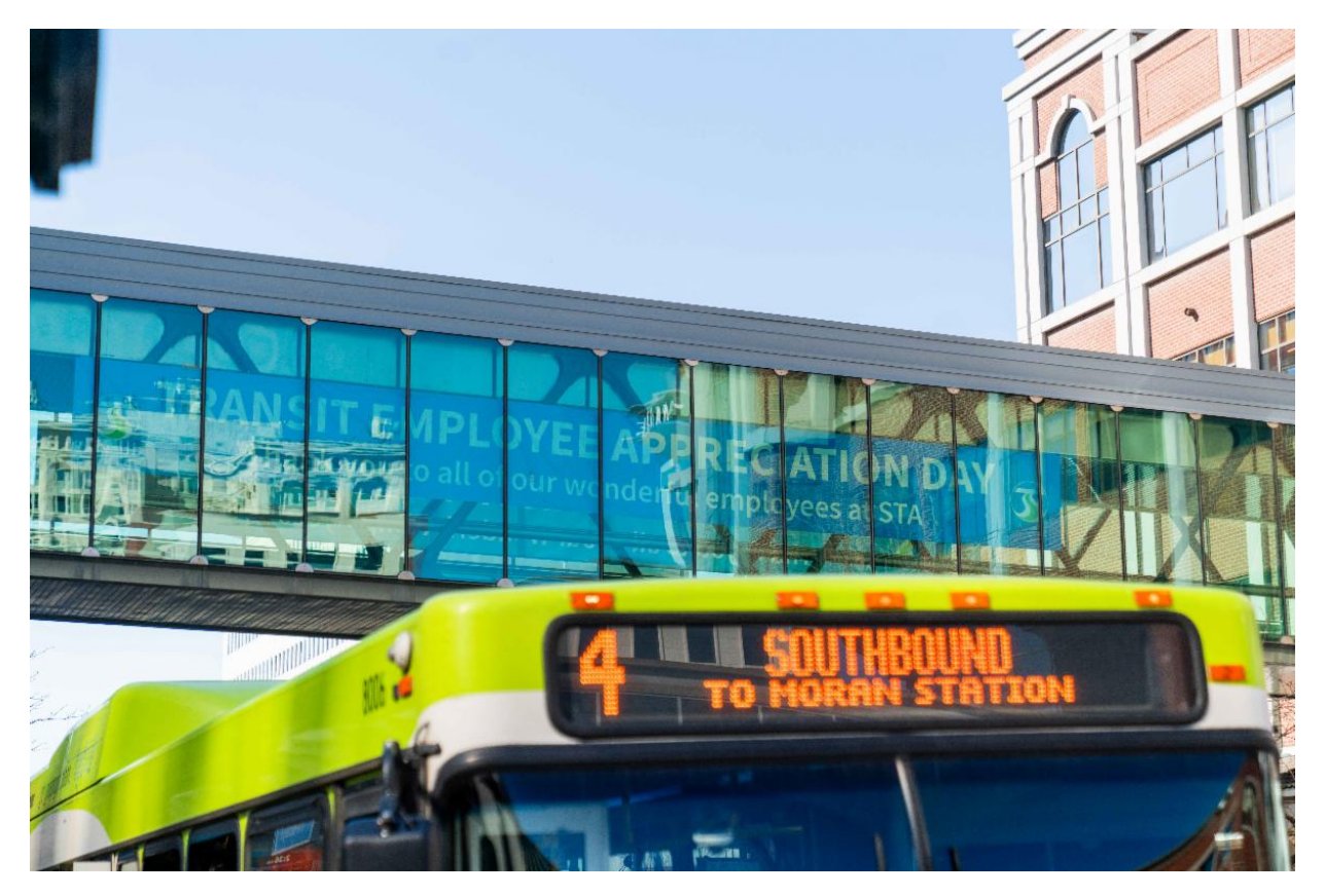
Above: A Transit Employee Appreciation banner placed on STA's skywalks

On Monday, March 18, STA joined transit agencies across the country in celebrating National Transit Employee Appreciation Day to honor dedicated transit individuals for all the work they do to provide transportation services and opportunity for all.