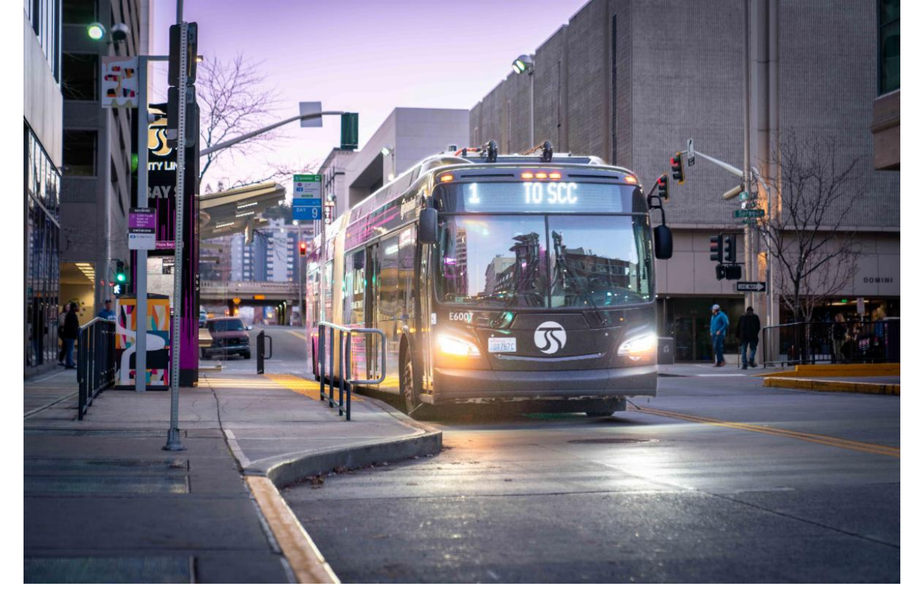
Above: A City Line bus waiting at STA Plaza Bay 9

STA is kicking off expanded public outreach efforts as part of the revision and adoption process for its Transit Development Plan (TDP) for 2025 – 2030.