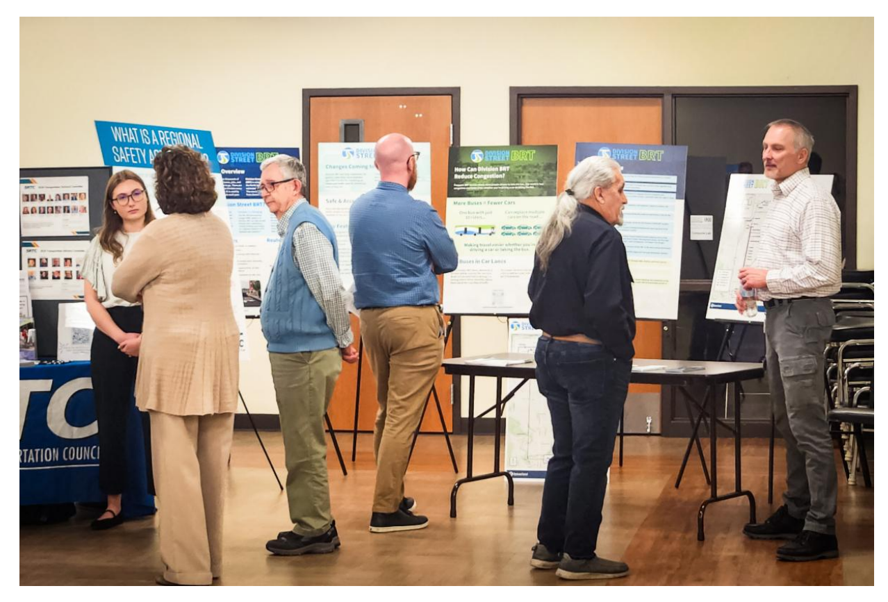
Above: Members of the public conversing at one of STA's recent open houses

STA is hosting a series of open houses across Spokane County in collaboration with regional transportation partners. The open houses, which started earlier this month and run through April 9, aim at fostering community engagement around key transportation projects in the region and providing an excellent venue for residents to learn more about current STA projects, future initiatives, and upcoming developments. Attendees have also been able to interact with representatives from local municipalities and other key stakeholders to learn about infrastructure investments.