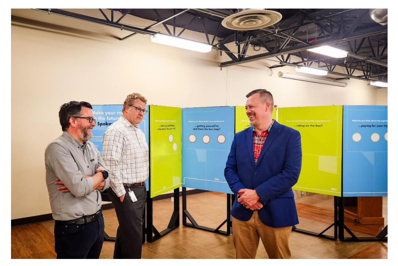
Above: STA staff standing in front of the interactive displays at a recent STA open house

As part of ongoing outreach efforts for its next 10-year strategic plan, Connect 2035 , STA has produced six interactive displays inviting the public to reflect and provide feedback on different aspects of using public transit.