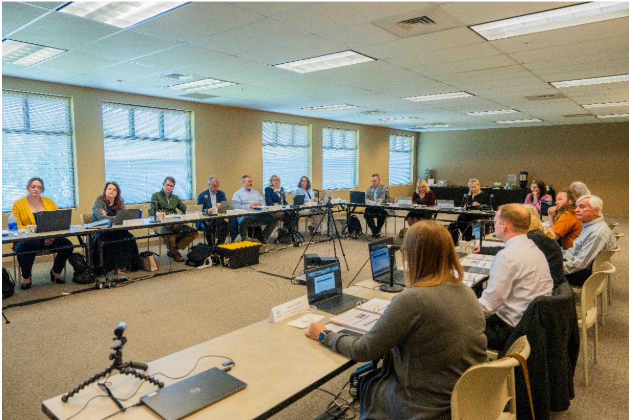
Above: STA Board members, staff, and representatives from the Center for Transportation and the Environment at the Fleet Transition Workshop