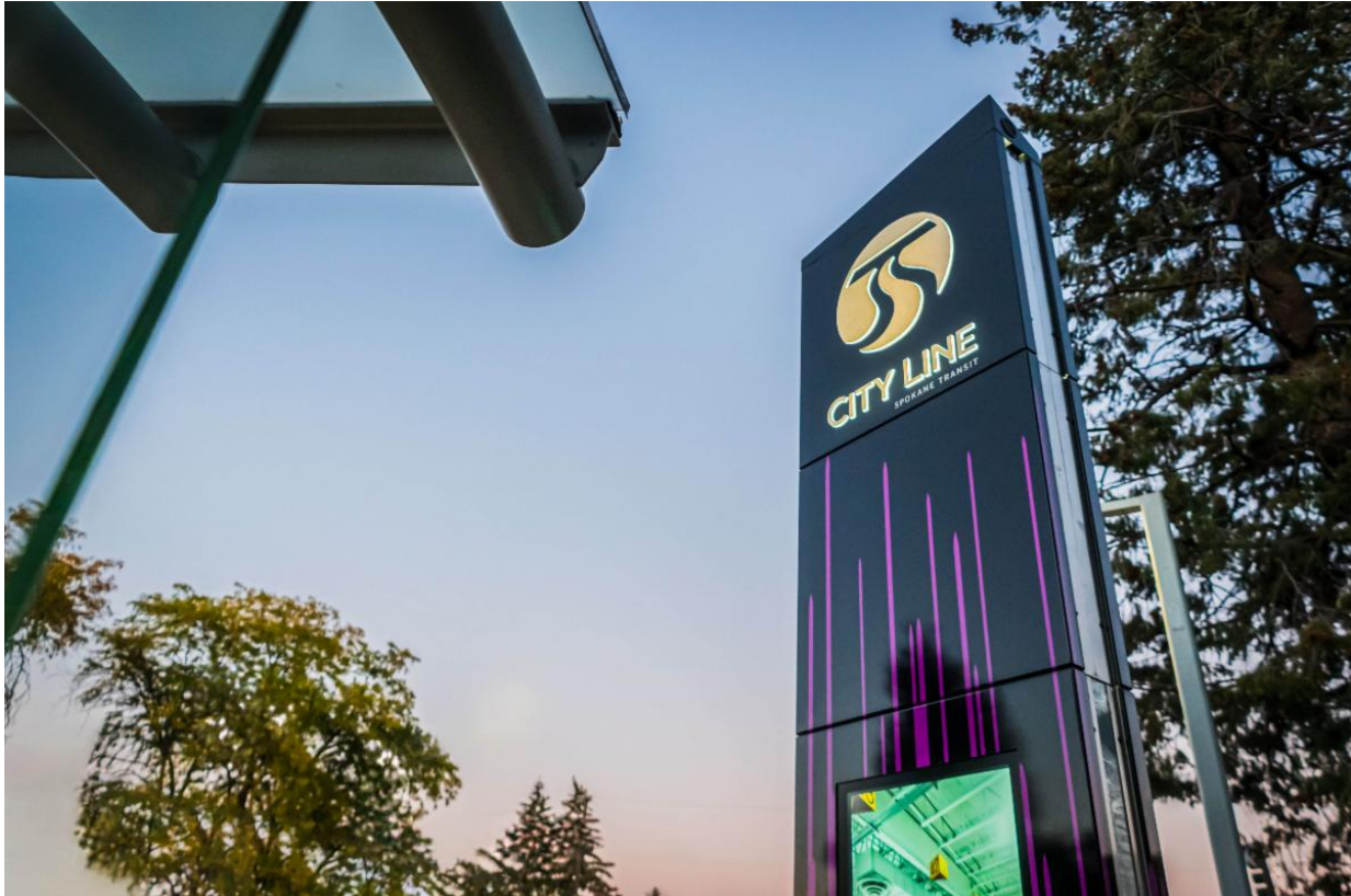
Above: A City Line marker and digital display

With the May Service Change, City Line’s midday service (9 am - 3 pm) has increased to every 10 minutes on weekdays; buses now run every 15 minutes on Sundays; and service now runs past 1 am Monday through Saturday. These changes bring City Line to its full, planned service levels.