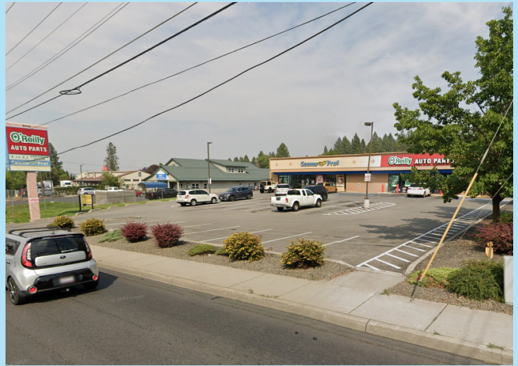
Street view of the station location