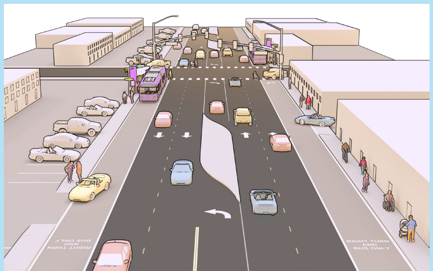
Draft corridor rendering, Division at Price/Magnesium to Division/Ruby couplet - design in process

For more information, visit www.spokanetransit.com/divisionbrt or email divisionbrt@spokanetransit.com