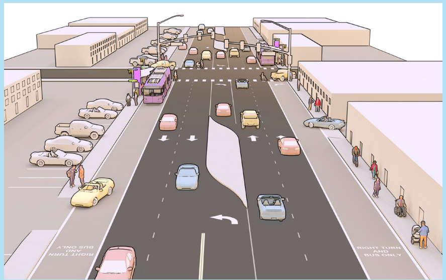
Draft corridor rendering, Division at Price/Magnesium to Division/Ruby couplet - design in process

For more information, visit www.spokanetransit.com/divisionbrt or email divisionbrt@spokanetransit.com