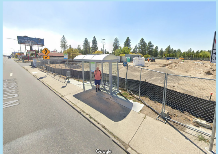
Street view of the station location