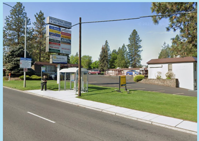
Street view of the station location (Google Street View)