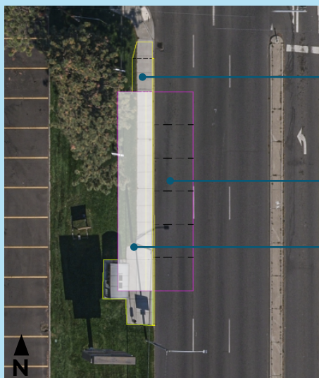
Draft station drawing - design in process