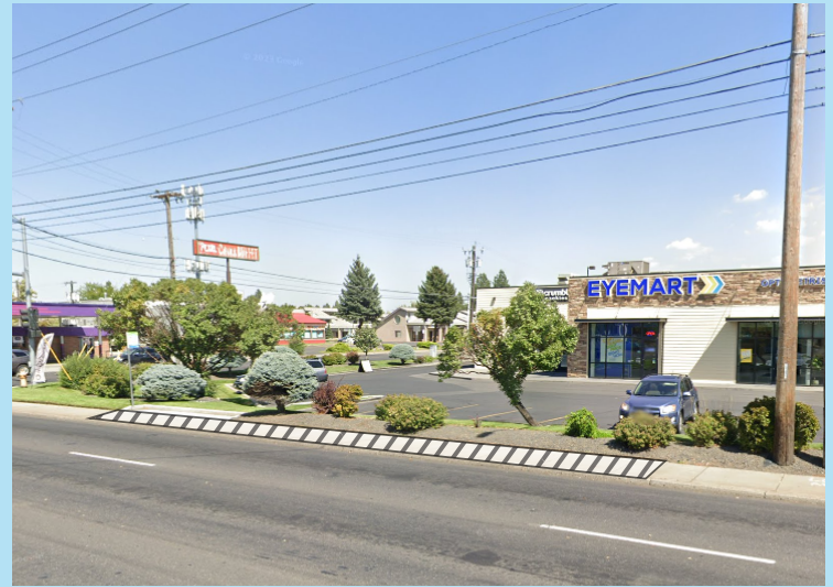
Street view of the station location