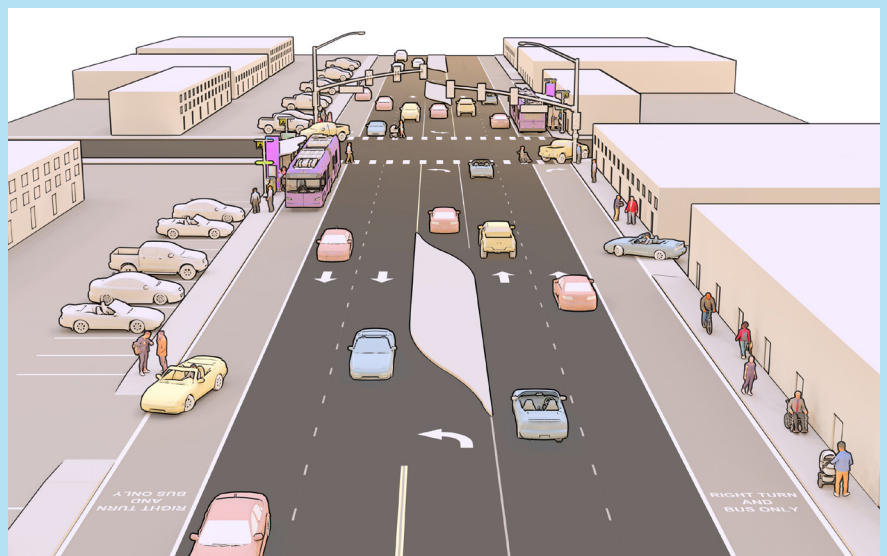
Draft corridor rendering, Division at Price/Magnesium to Division/Ruby couplet - design in progress

For more information, visit www.spokanetransit.com/divisionbrt or email divisionbrt@spokanetransit.com