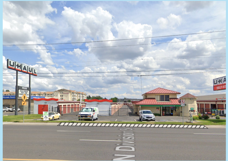
Street view of the station location