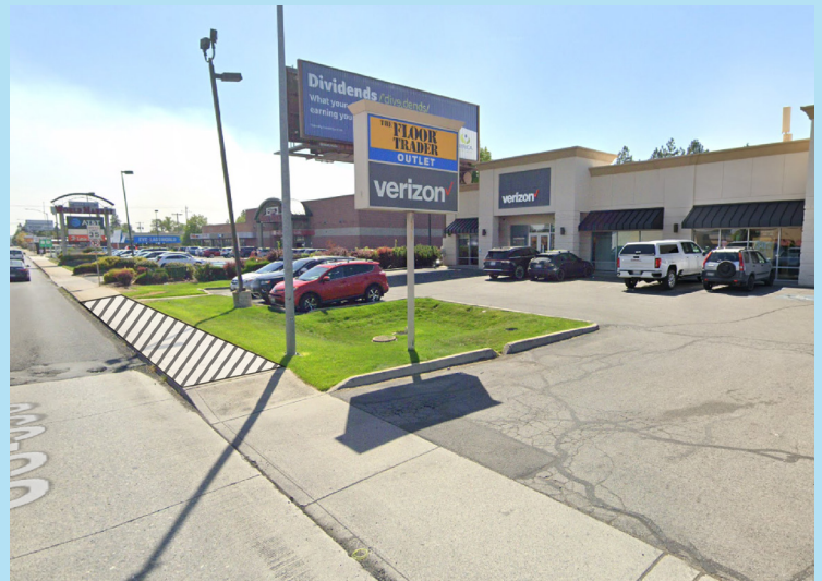
Street view of the station location (Google Street View)