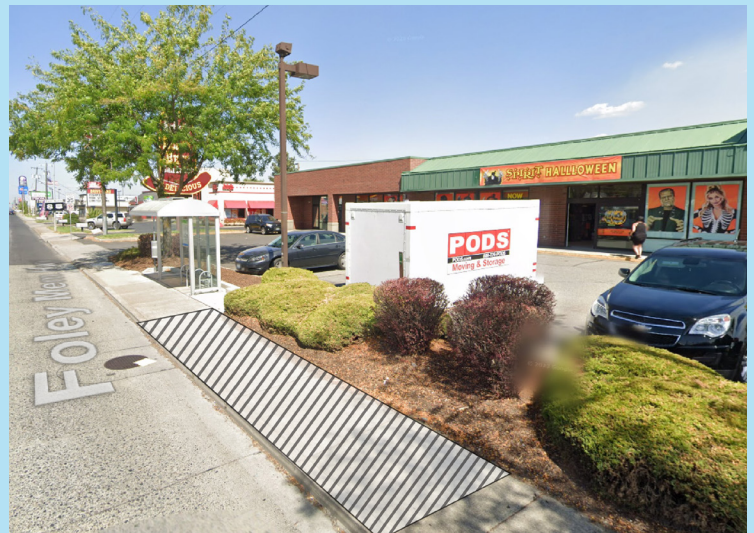
Street view of the station location (Google Street View)