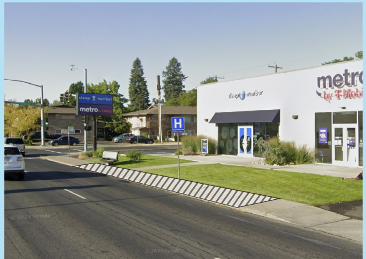
Street view of the station location