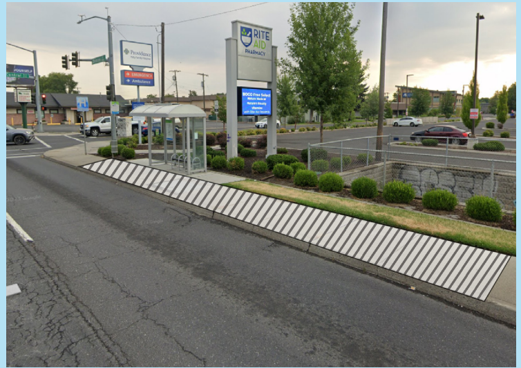
Street view of the station location (Google Street View)