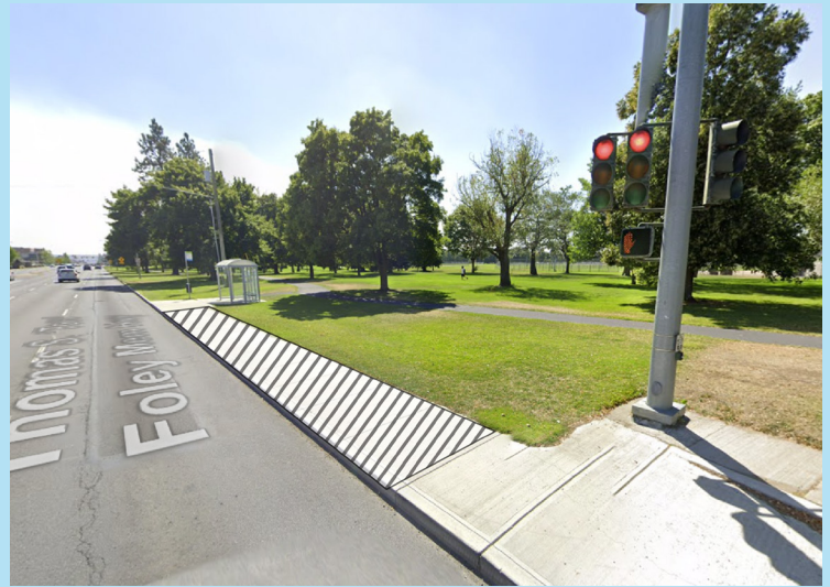
Street view of the station location