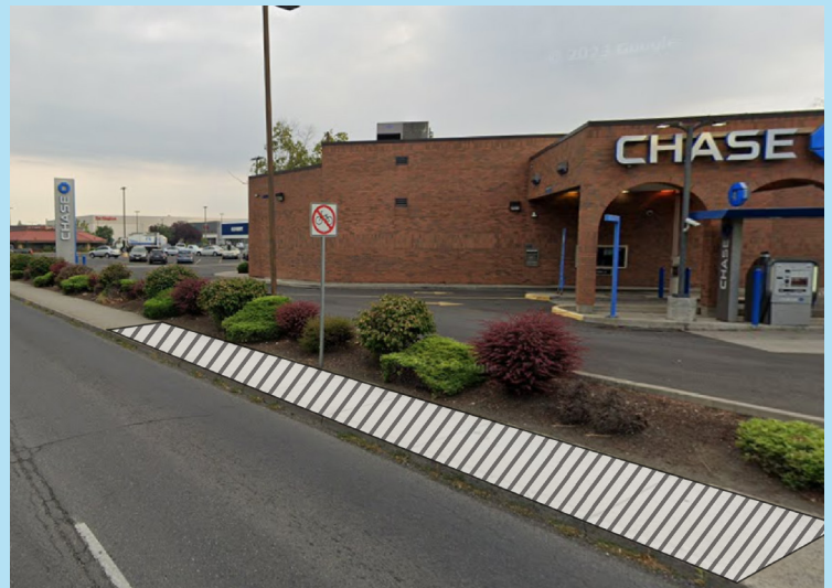
Street view of the station location (Google Street View)