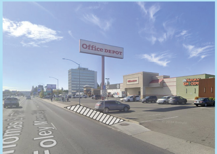
Street view of the station location