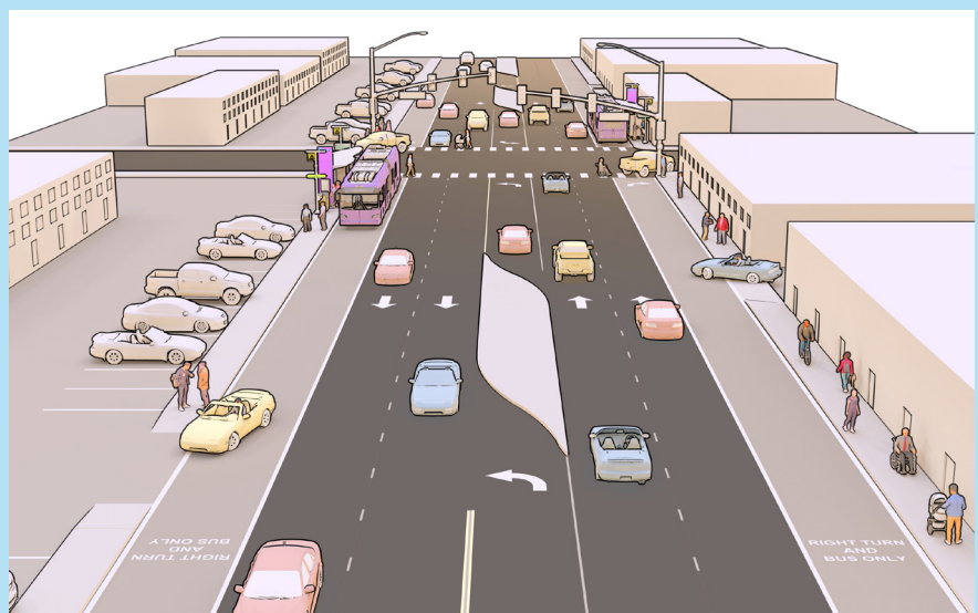
Draft corridor rendering - Division at Price/Magnesium to Division/Ruby couplet - design in progress

For more information, visit www.spokanetransit.com/divisionbrt or email divisionbrt@spokanetransit.com