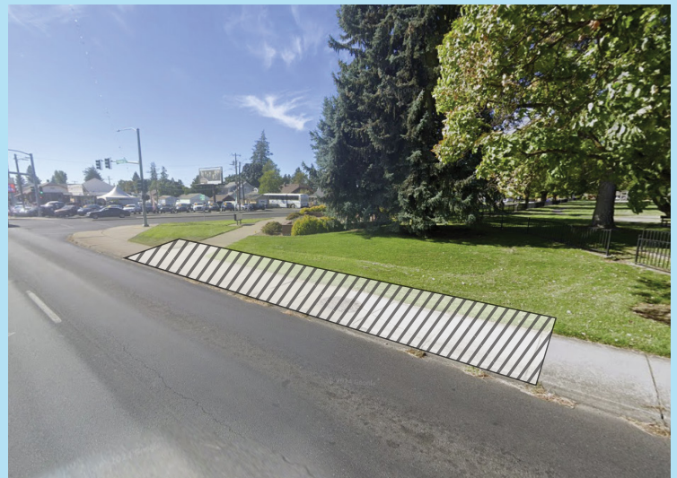
Street view of the station location (Google Street View)