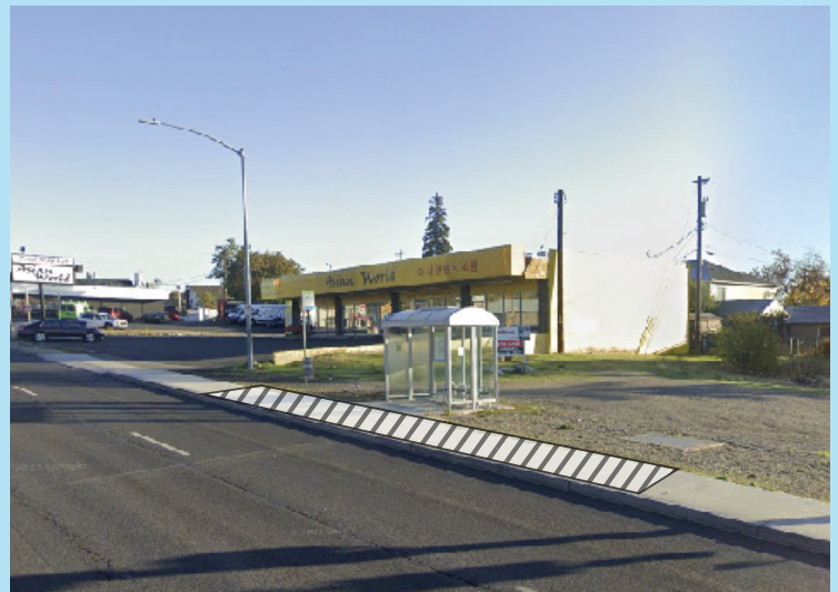
Street view of the station location (Google Street View)