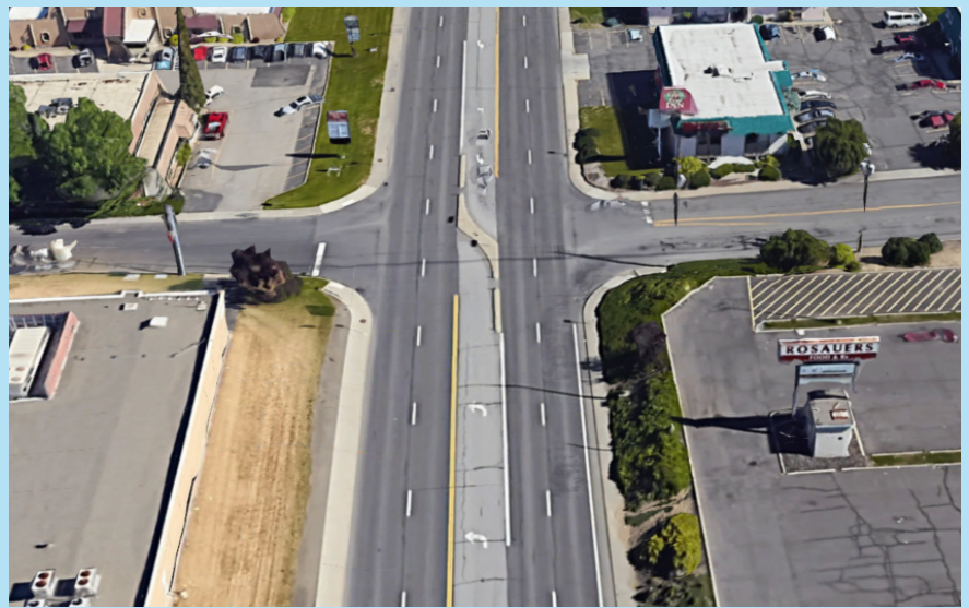
Aerial view of Division at Holland - corridor rendering design in progress

For more information, visit www.spokanetransit.com/divisionbrt or email divisionbrt@spokanetransit.com